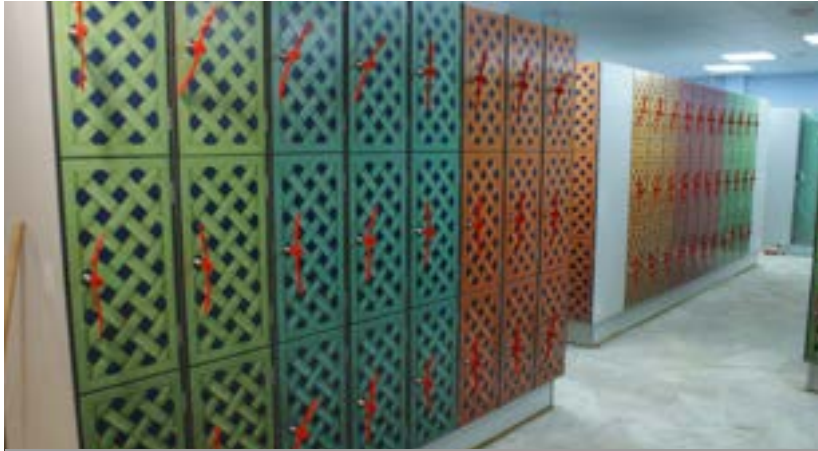
Alton Towers - Lockers and Washrooms

Alton Towers had 1.98 million visitors last year and needed a vast amount of lockers in a high quality specification to cope with the daily traffic. These were printed to suit the theme and available in various sizes to increase capacity.