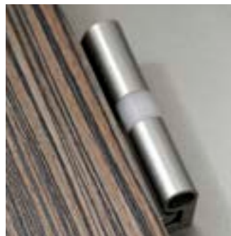
Rising Butt Hinge