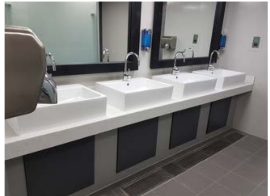
Sandace System with Top Mounted Washbasins and Waterfall Taps