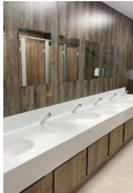
Typical Sandace Unit with Moulded Basin

A bin can be integrated into the vanity unit by moulding a hole into the top